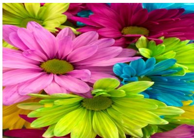
Spring has sprung