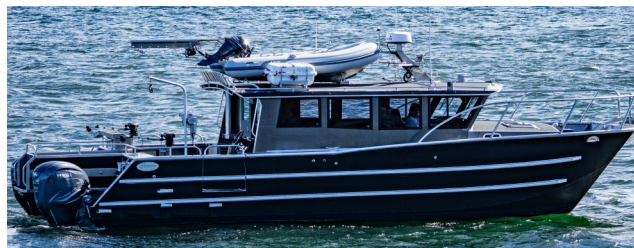
The Mary Jane

It seems as spring is trying to arrive. There are certainly sunnier days and the plants are getting happier. It's the time to get the boats ready and prepared for the season. That feels good !!