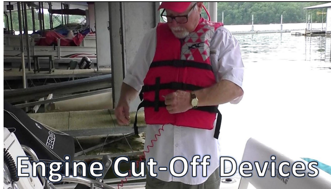
Engine Cut-Off Devices

Are you aware of the legal requirement for using engine cut-off devices? This is a requirement that could save your life .