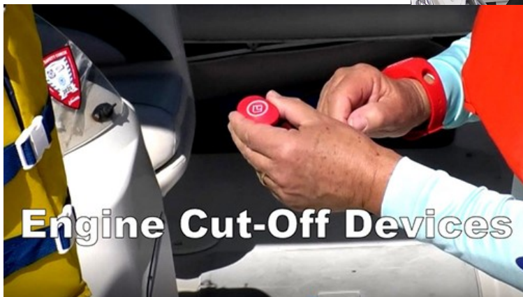
Engine Cut-Off Devices